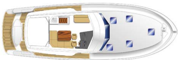
cruising flybridge - skylounge